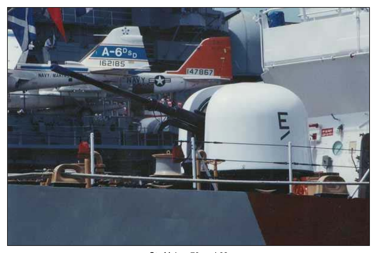
Oto Melara 76mm L62

range is unlimited, thanks to a slip ring for off-mount connections. Elevation limits are from -15 to +85 degrees. The gun is equipped with a muzzle brake and fume extractor. The gun's watertight fiberglass construction reduces the weight of its mount to only 7.5 tons. A hatch in the rear allows access for maintenance.