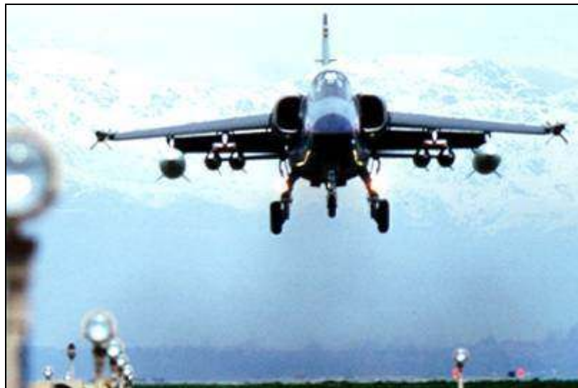
Platform for Scipio Radar System – The AMX Attack Jet