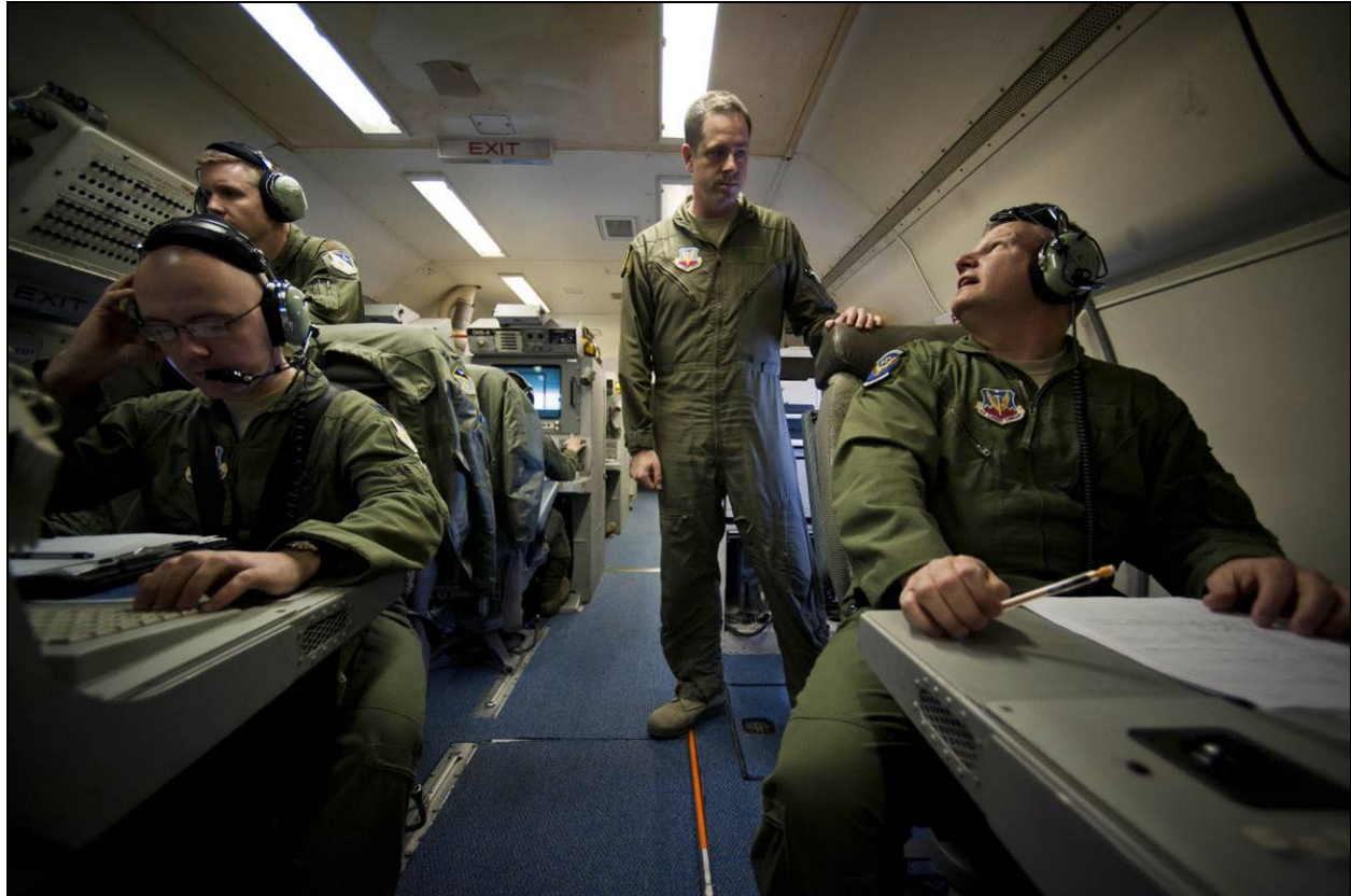
Crewmen at the Controls of a U.S. Air Force E-8C Joint STARS